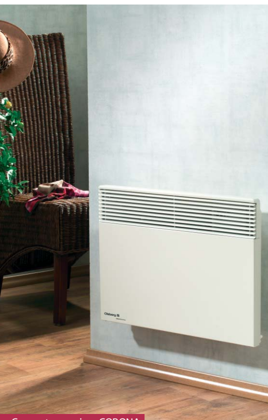
Convactor series CORONA